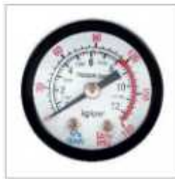
PRESSURE GAUGE (SMALL)