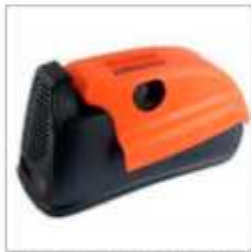
NEW DESIGN COVER (2 PCS SET)