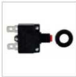
OVERLOAD PROTECTOR SWITCH