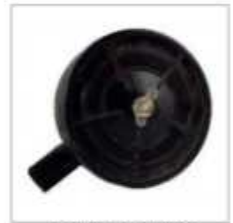
AIR FILTER (PVC)