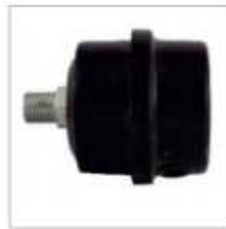
AIR FILTER (METAL)