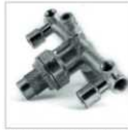
WITHOUT REGULATOR ASSEMBLY