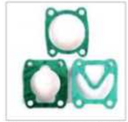
GASKET (3PCS SET)