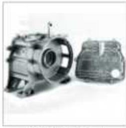
CRANK CASE + SIDE COVER