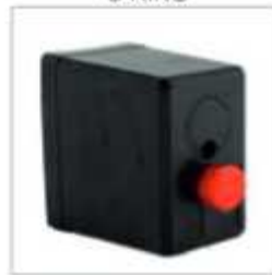
PRESSURE SWITCH COVER