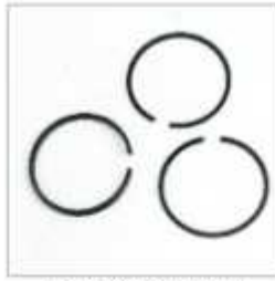
RING (3PCS SET)