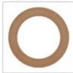
CONNECTOR ROD RING