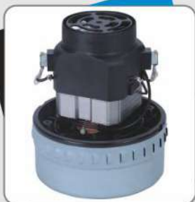
ELECTRIC MOTOR (3x1200 W)