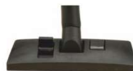
WET AND DRY BRUSH