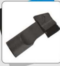
2 IN 1 NOZZEL