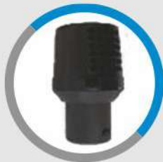
Silencer (Reduce Noise Level)