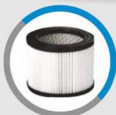
Hepa Filter (Air Purifier Filter)