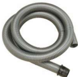
HOSE WITH 2 SIDED CONNECTOR