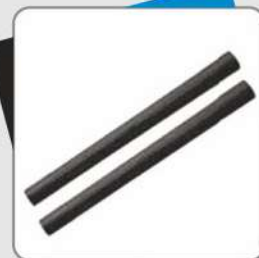
TWO SECTION TUBE