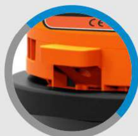
Dust Shake Button