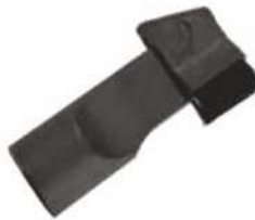
2 IN 1 NOZZEL