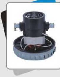
ELECTRIC MOTOR (1200 W)