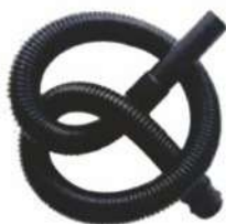
TWO SIDE HOSE