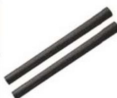
TWO SECTION TUBE