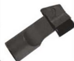
2 IN 1 NOZZEL