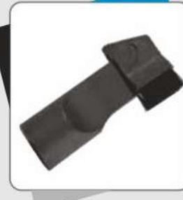
2 IN 1 NOZZEL