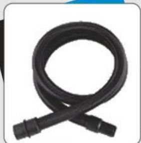
TWO SIDE HOSE