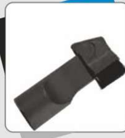
2 IN 1 NOZZEL