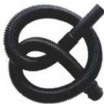
TWO SIDE HOSE