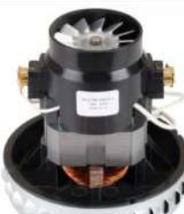
ELECTRIC MOTOR (1000 W)