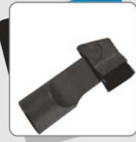
2 IN 1 NOZZEL