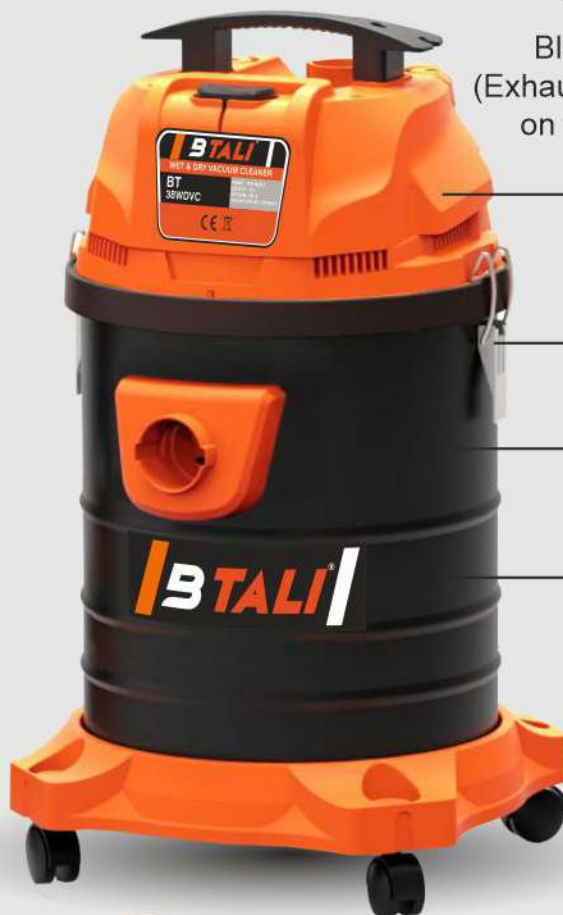
Tapper Design For Easy Storage