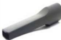
NOZZEL FOR VACUUM