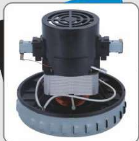
ELECTRIC MOTOR (1200 W)