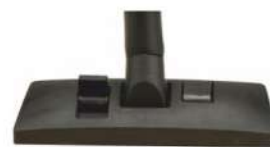
WET AND DRY BRUSH