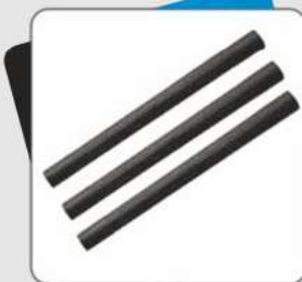
THREE SECTION TUBE