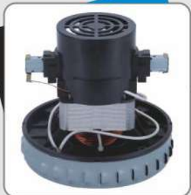
ELECTRIC MOTOR (1200 W)