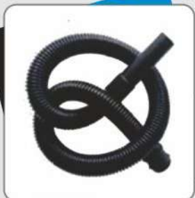
TWO SIDE HOSE