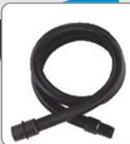
TWO SIDE HOSE