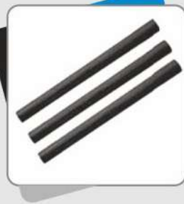
THREE SECTION TUBE