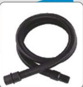
TWO SIDE HOSE