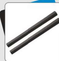
TWO SECTION PIPE