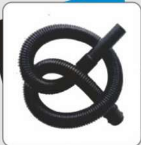
TWO SIDE HOSE