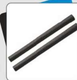
TWO SECTION PIPE