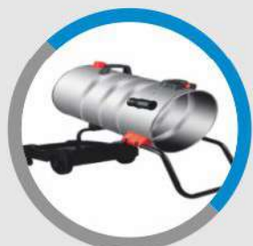
Easy Pulling Out