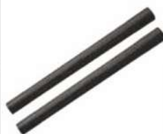
TWO SECTION TUBE