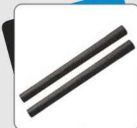
TWO SECTION TUBE