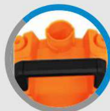
Blow Function (Exhaust Dust Particles on Tricky Areas)