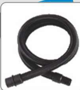
TWO SIDE HOSE